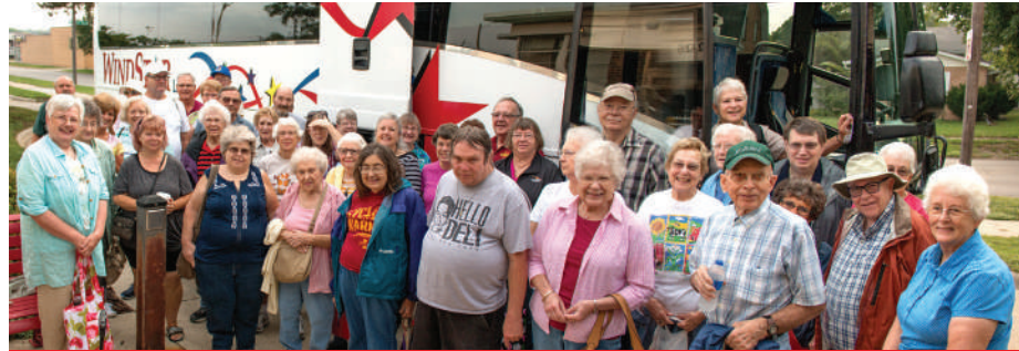
Many area seniors enjoyed a day trip to the Iowa State Fair on August 16th.

Many of today's seniors — once able to vigorously participate in life's daily activities during their younger years — find themselves in a routine that feels uninspiring. Some feel like they are missing out on important friendships and activities.