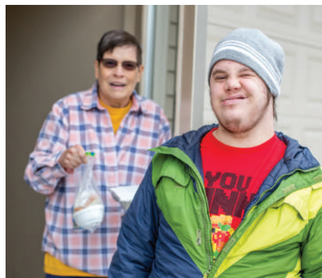
Mainstream Living participants find joy in serving Meals on Wheels.