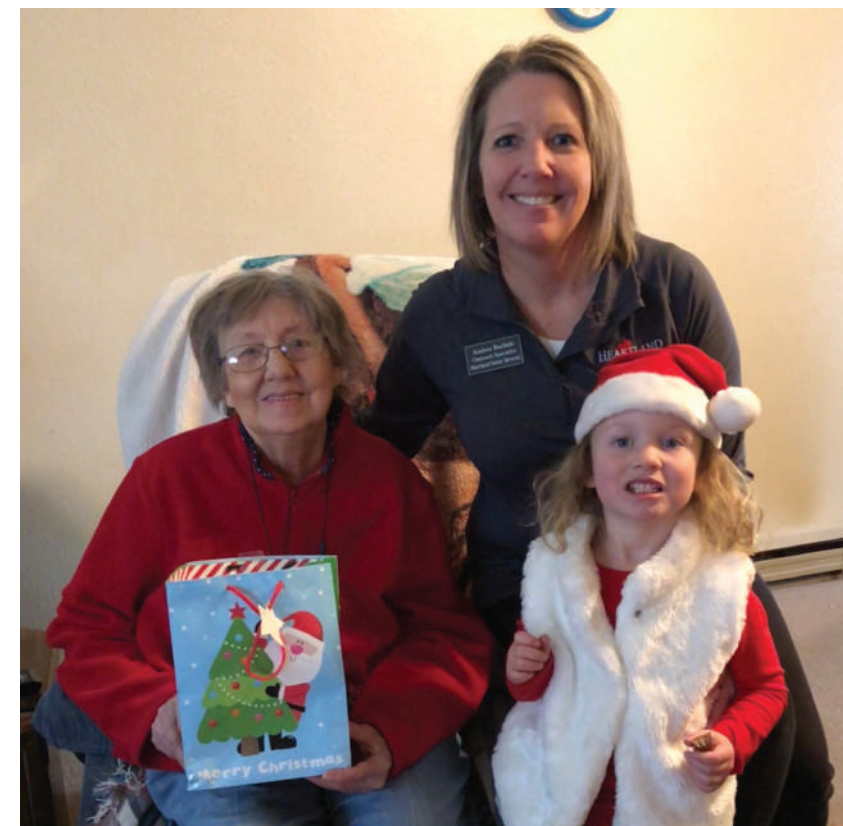
Story Construction has a holiday tradition of donating gifts to HSS at Christmas time.