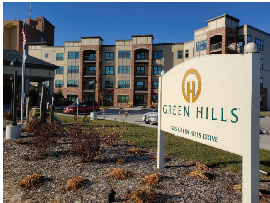
Green Hills will be the home to the first satellite Adult Day Center.

The Adult Day Center (ADC) is an essential part of many of our seniors' lives, providing a safe and stimulating environment for those who are unable to be at home alone. Until now, this service has been available only at our Heartland Senior Services building, but we are excited to announce an additional ADC location. Beginning in 2020, Heartland will offer Adult Day Center services at the Green Hills Retirement Community located at 2205 Green Hills Drive on Tuesdays from 9:30 AM to 1:30 PM.