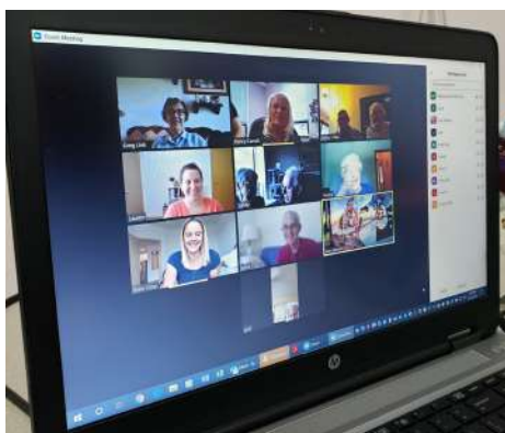
Staff, participants and caregivers always enjoy their time together on ZOOM!