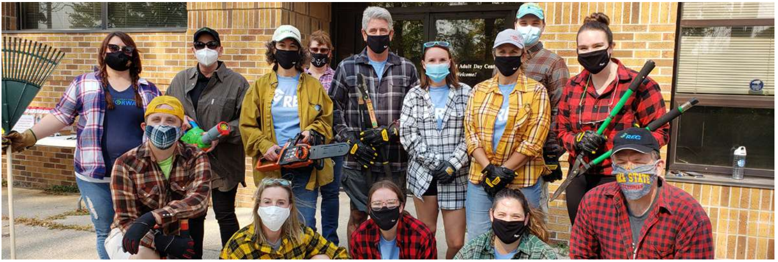
REG employees pause for a group photo.