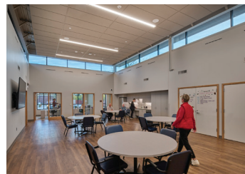
Adult Day Center

"I certainly am blessed because the facility is here, and I can take advantage of it." 🍷