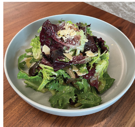
Bistro House Salad

Every dish is made with fresh ingredients by our talented Bistro